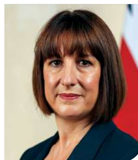
Official portrait of Rachel Reeves MP, by Lauren Hurley, licensed under Open Government Licence v3.0

The OBR, blushing from its pre-emptive publication of documents on the day, at least managed to summarise matters neatly: "...the Budget delivers a frontloaded increase in spending of £9 billion and backloaded increase in taxes of £26 billion".